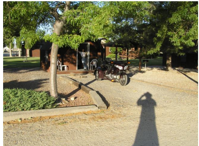
Cabin at Humboldt River Ranch

I would like to save the Cabins for those of us that don't have trailers or tents, or that can't camp. So please call or email