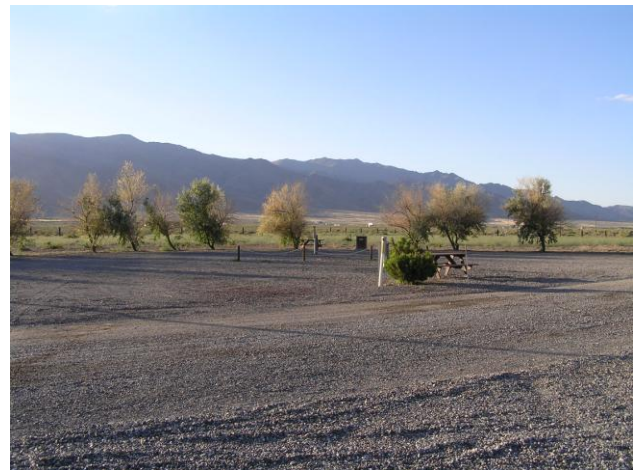
Trailer sites with view