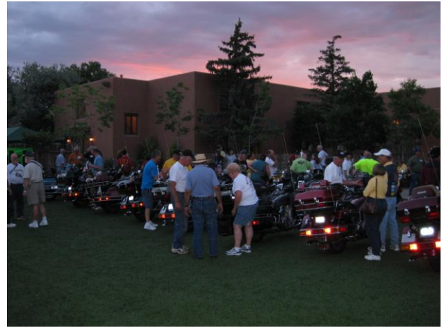
Bike Show Tues night with nice sunset