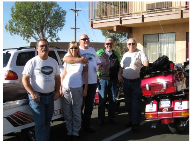
Barstow, CA on the way to Santa Fe