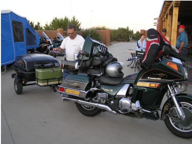
Tony Curtis packing for the trip back home