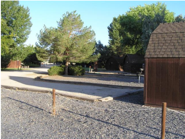
View of the resort