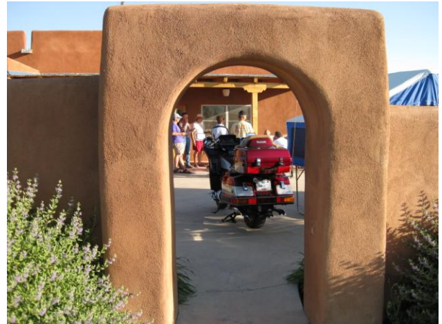
Nice view of a Voyager in New Mexico