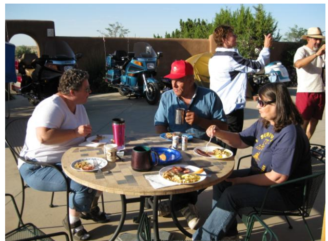
Breakfast on Friday before we all head home