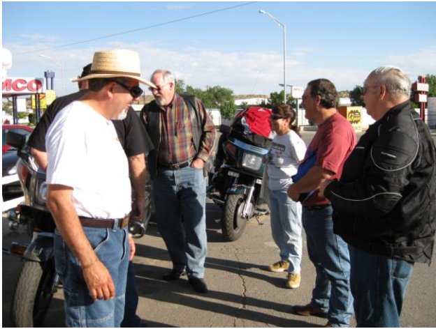
Riders' meeting Gallup, NM