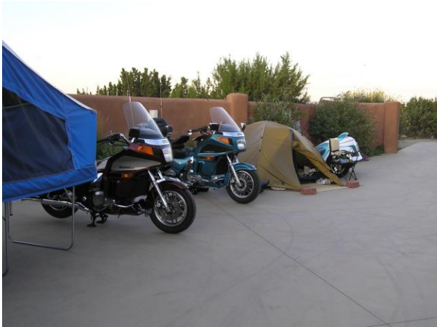
Santa Fe Skies- all campgrounds should be this nice