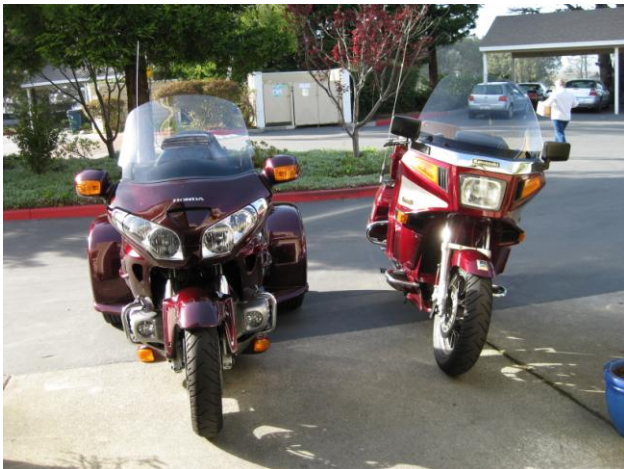
The dream rides after a good washing

Morro Shores Inn & Suites Phone 805 772 0222 290 Atascadero Rd $59 / $69