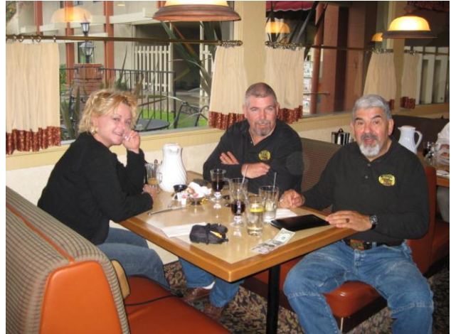
Sunday morning breakfast at Piccadilly Inn