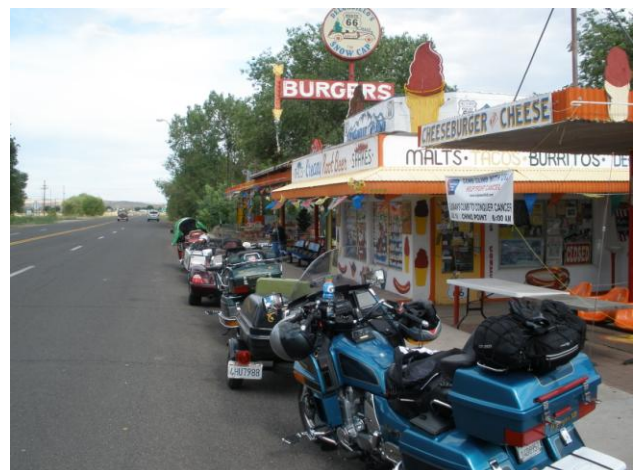
Ice Cream stop in Seligman, AZ, on the way to Santa Fe.