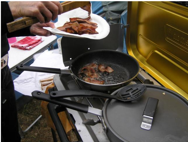
Can't you just smell that bacon!

We all decide to ride down to Cannery Row and do some sightseeing. This is June and there are tourists everywhere. Finding parking took awhile. We find a coffee shop overlooking the Monterey Bay and we take pictures and just play the part of a tourist.