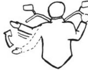
Go ahead and pass me