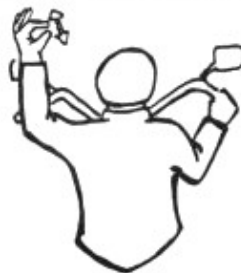
Turn off your turn signals