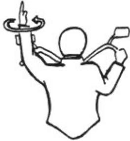
Start your engines