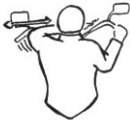
Stop your engines