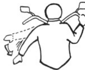
Don't pass me