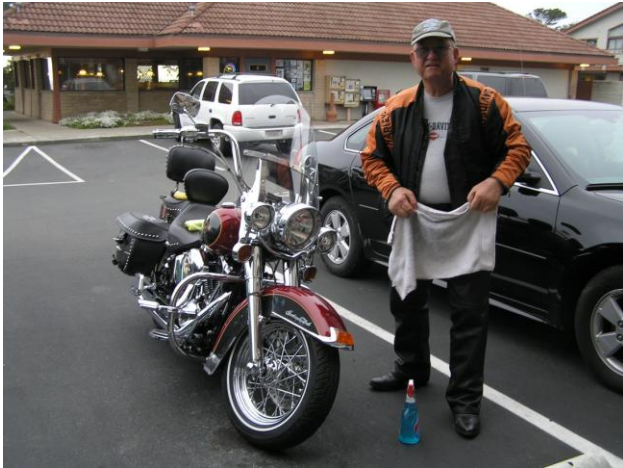
Lee House has a lot of chrome to keep shiny!