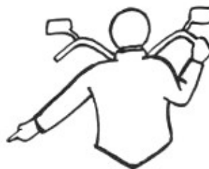
Hazards on the road