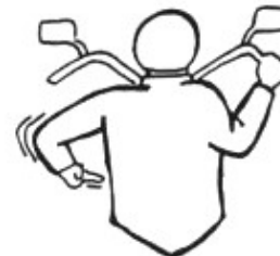
Time for a pit stop