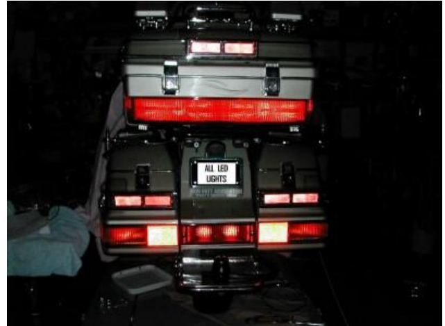
The finished product!