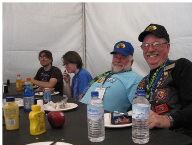
Volunteers were fed well, you can tell by the big grins!