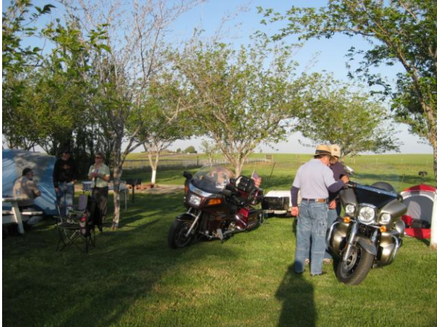
Our campsite at the San Luis RV Resort