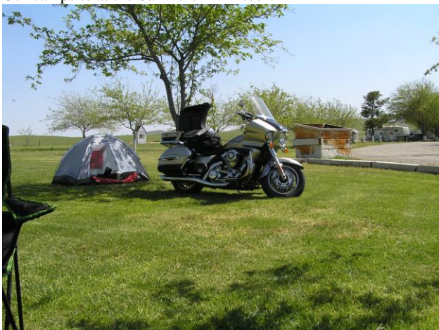
It just doesn't get any better than this!