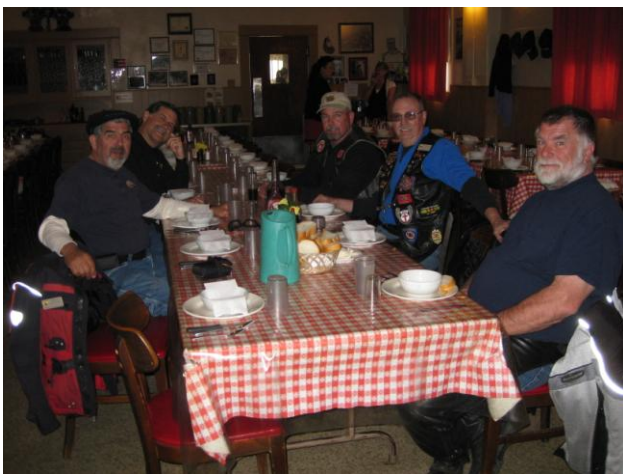
A hungry group eagerly awaits the first course