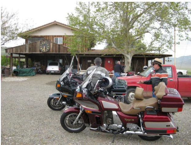
Good-looking bikes at the Panoche Inn

We leave the Ninth Hole and head for Panoche. We head south on Hwy 25 and then East on Panoche Rd. Ernie is leading riding that new Voyager 1700. As the road begins to narrow, get twisty and rough you can imagine what a cowboy felt being out in the wide open country, with the rolling hills and dry creeks. This goes on for a while when all of a sudden some buildings come into view and Ernie pulls into the earthen parking lot. We have arrived at the Panoche Inn.