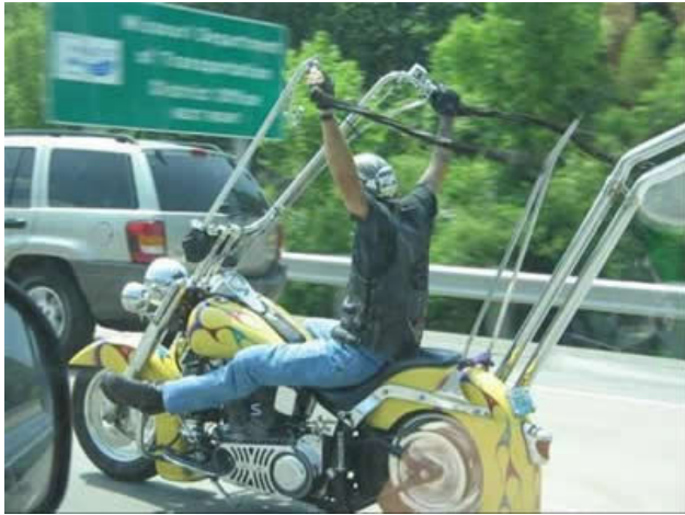
Here's an image that cries "too much stuff"